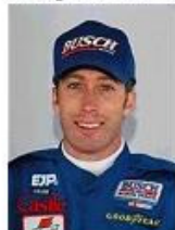
BNS Champion Fri., Jan. 3