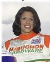
Busch North Sun., Jan 5