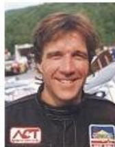
ACT Champion Sun., Jan. 5