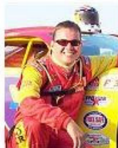
PASS champion Fri., Sat. & Sun.