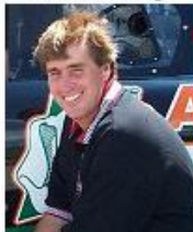
Busch North Fri., Jan 3