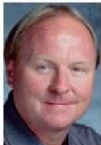
FOX TV Sat., Jan 4